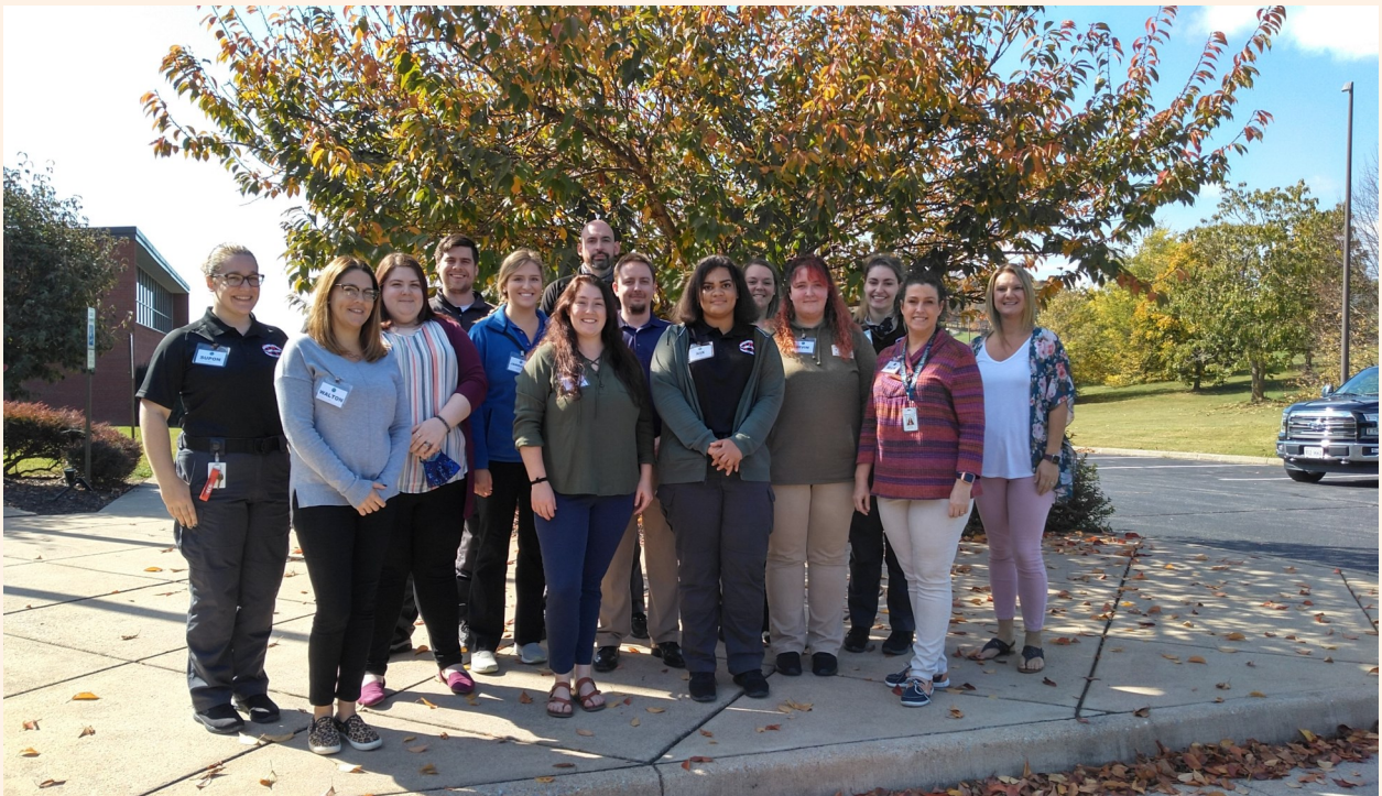
86th Basic Communications Officer October 23, 2020