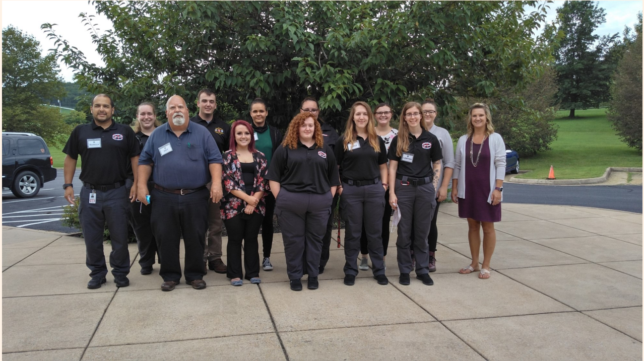
85th Basic Communications Officer August 28, 2020